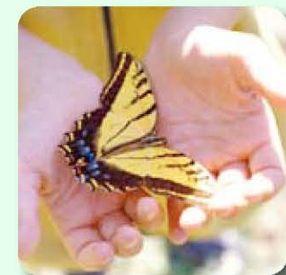
Aviary, Butterfly Park