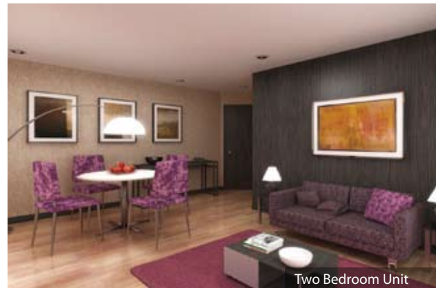
Two Bedroom Unit