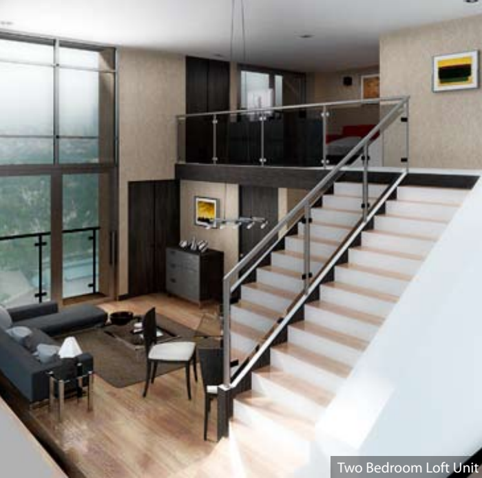
Two Bedroom Loft Unit