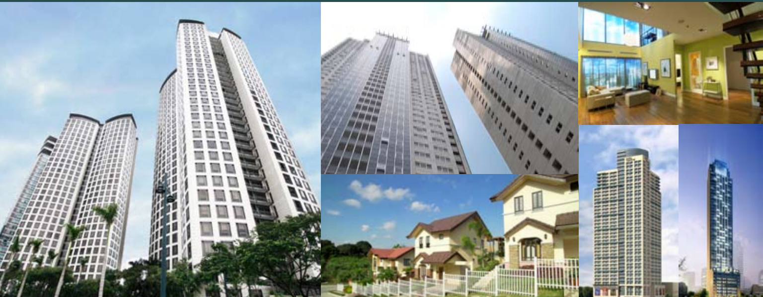
(Clockwise from left) Essensa, South of Market, GSM Loft, GSM, Soho Central, Canyon Ranch