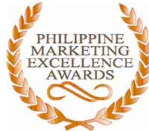
CANYON RANCH Most Outstanding Private Residential Community in the Philippines 2005