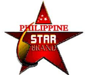
CENTURY PROPERTIES GROUP Winner Best Managed Philippine Brand – Housing Developer 2006