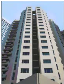
PACIFIC PLACE Type: Residential/ Office Location: Pearl Drive, Ortigas Center, Pasig City