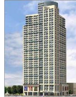
SOHO CENTRAL The First transportation- oriented development in the country