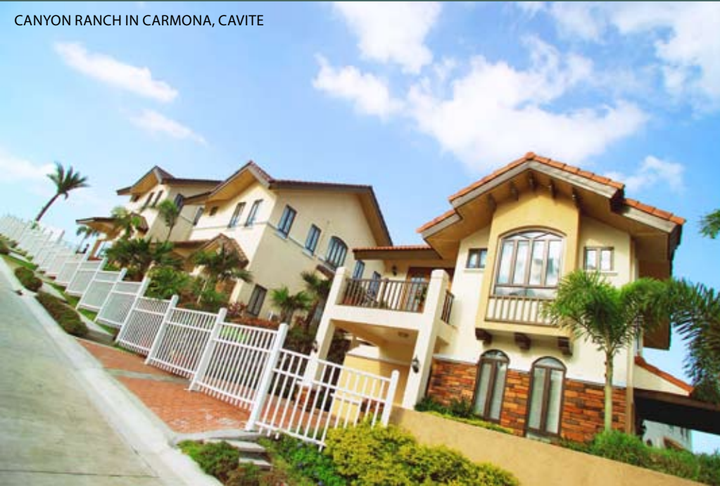
CANYON RANCH IN CARMONA, CAVITE