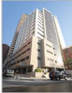
BEL-AIR SOHO Type: Residential Boutique Location Polaris St., Makati City