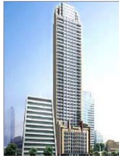
GRAND SOHO MAKATI Fully-fitted, Fully-furnished Makati condo with 3 exceptional interior design options