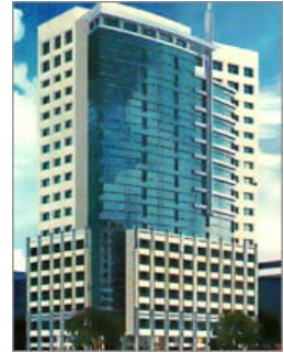
MEDICAL PLAZA MAKATI Type: Clinics/ Residential Location: Amorsolo St, Legaspi Village., Makati City