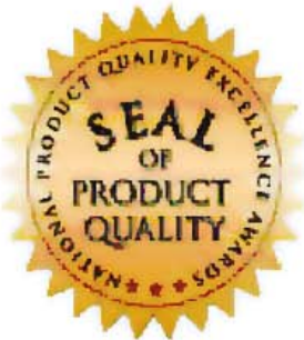
CENTURY PROPERTIES GROUP Winner Best Philippine Real Estate Firm 2005