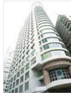
OXFORD SUITES Type: Residential/ Hotel Location: P. Burgos St., Makati City