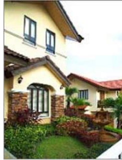
CANYON RANCH The only Wi-Fi-integrated community in the South