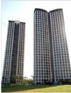
ESSENSA EAST FORBES Voted by Asiaweek as the Best Residential Building in the Philippines