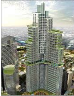
THE GRAMERCY RESIDENCES AT CENTURY CITY The only Fully-serviced, Hyper-amenitized luxury condo in the Philippines.