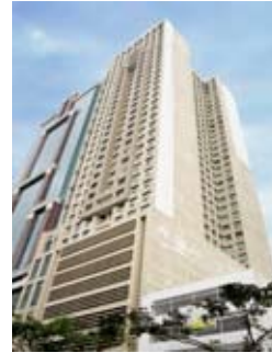
WEST OF AYALA Type: Residential/ Office Location: Sen. Gil Puyat Ave., Makati City