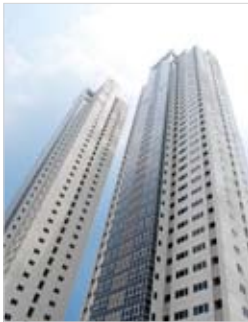
SOUTH OF MARKET The first Fully-fitted and Fully-furnished condo in the Philippines