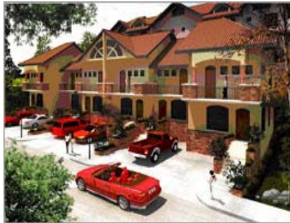
THE CASITAS AT CANYON RANCH The only Fully-fitted, Fully-furnished, Fully- serviced homes in Asia