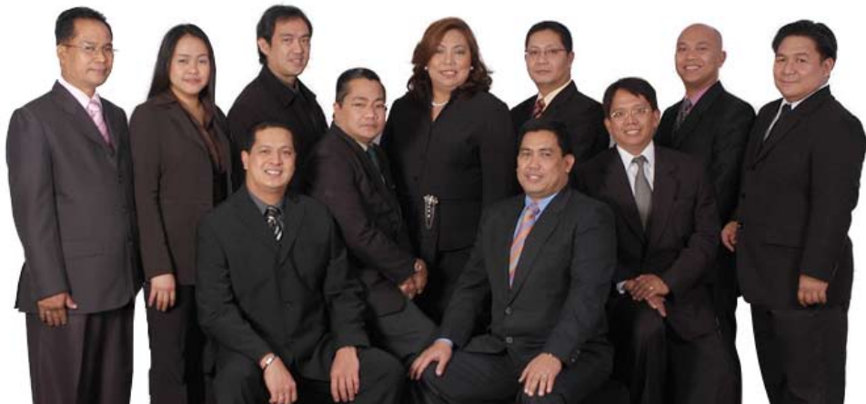
SALES Vice Presidents and Project Directors