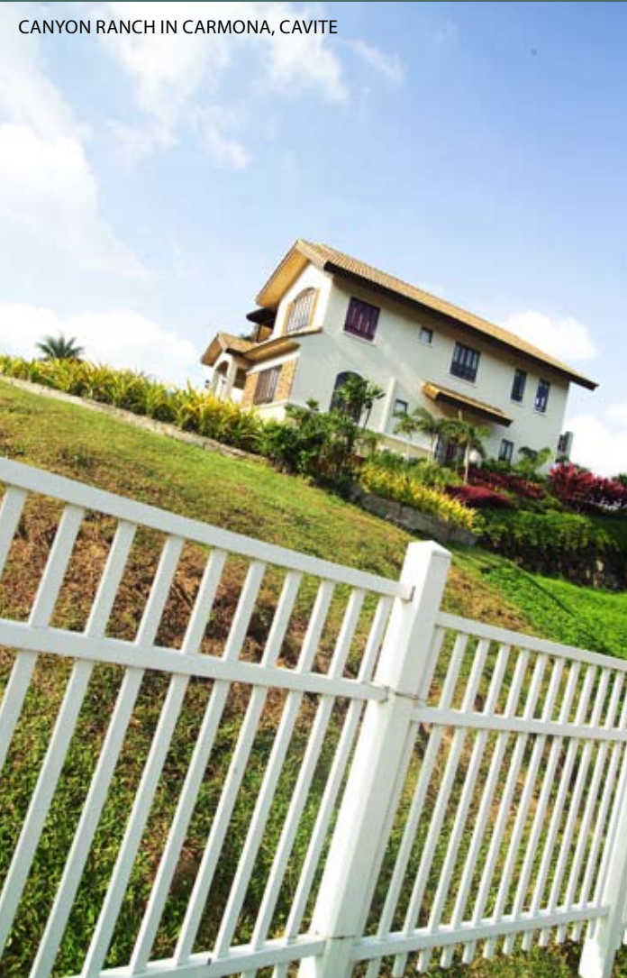
CANYON RANCH IN CARMONA, CAVITE