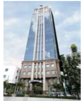
ONE MAGNIFICENT MILE Type: Office Location: San Miguel Ave., Ortigas Center Pasig City